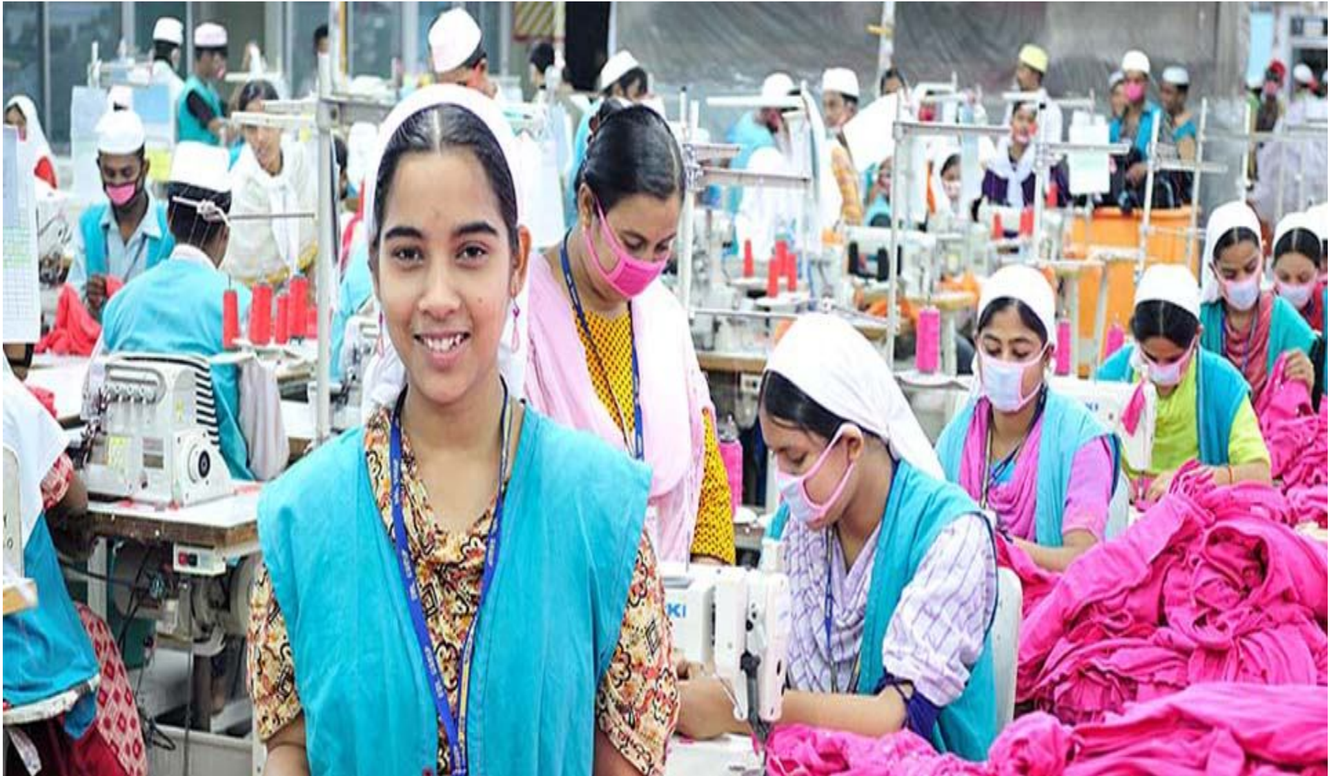
A partial view of Quality Inspection.